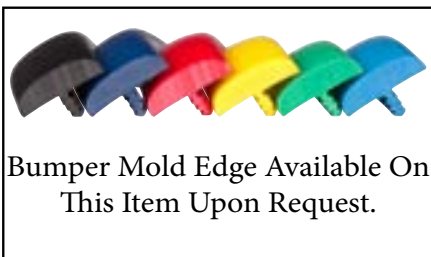
Bumper Mold Edge Available On This Item Upon Request.

PLEASE NOTE: Desk Orders Meeting Volume Quantities ALWAYS Have the Option of Choosing ANY Standard Formica or WilsonArt Laminate at NO ADDITIONAL UPCHARGE