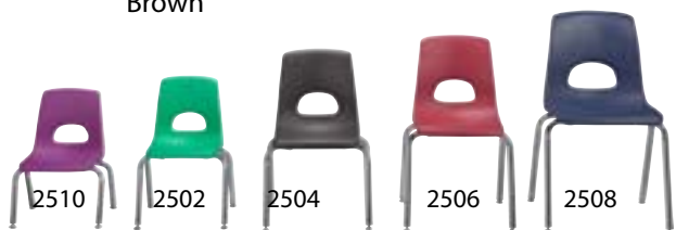
Available in 5 seat heights: 18", 16", 14", 12" and 10"