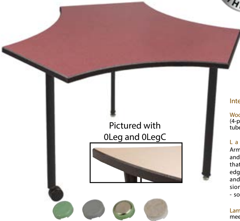
Pictured with OLeg and OLegC