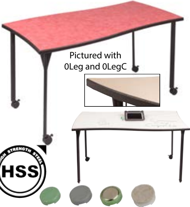
Pictured with 0Leg and 0LegC