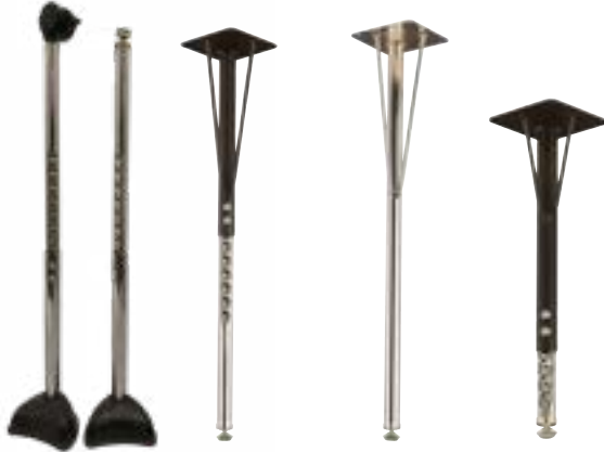
2331S-Set 2331Set 1029Set 1523Set