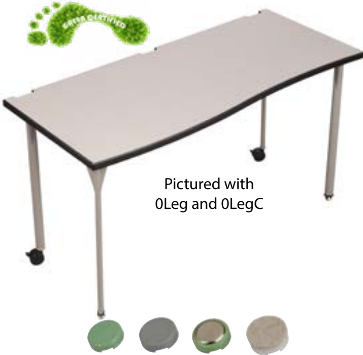
Pictured with 0Leg and 0LegC