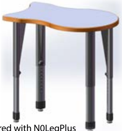
Pictured with N0LegPlus