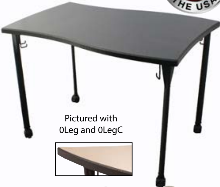
Pictured with 0Leg and 0LegC