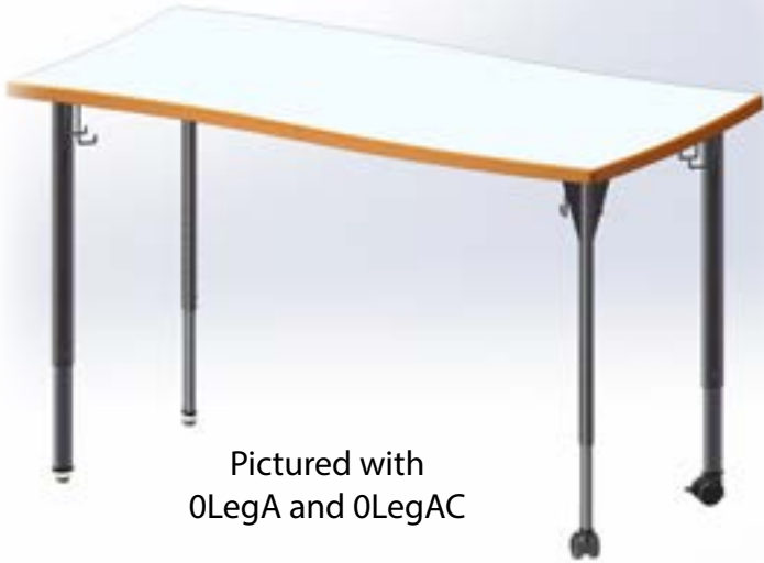
Pictured with 0LegA and 0LegAC