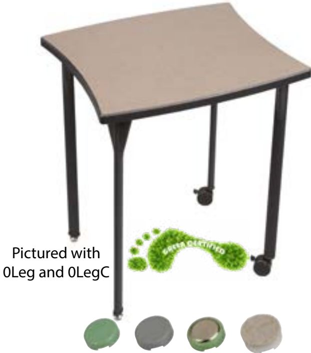
Pictured with 0Leg and 0LegC