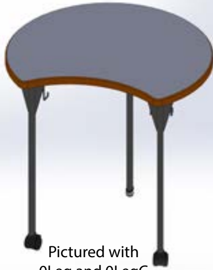
Pictured with OLeg and OLegC