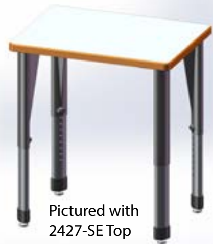
Pictured with 2427-SE Top