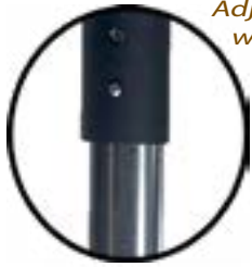
Adjustable legs with push button